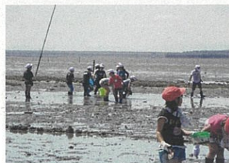
Observation of tideland of Ariake Sea

With a theme of World Heritage, region, environment, or welfare, students learn about their familiar subjects. By learning such subjects, they feel the value of their hometown, and they can think and act as a part of their communities.