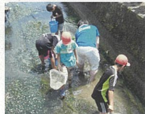
Observation of a river that goes to the sea