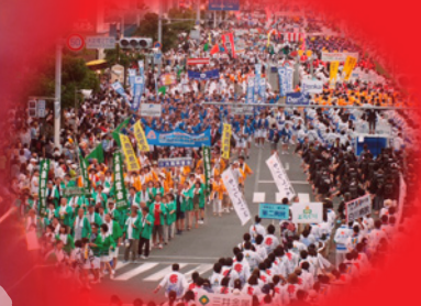
The 10,000 People Dance