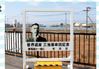
Photo frame available at the view point

Get off the bus at Mikawa-machi 1-chome bus stop then walk 5 min. to the view point.